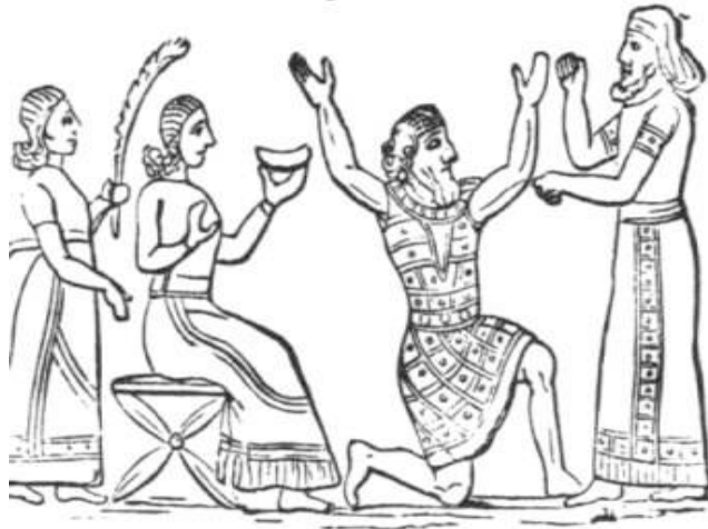
Woman with cup ** from Babylon.—(KITTO'S Biblical Cyclopaedia.)

** The shape of the cup in the woman's hand is the same as that of the cup held in the hand of the Assyrian kings; and it is held also in the very same manner. - See VAUX, pp. 243, 284.